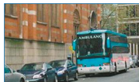
The Jumbulance, pictured outside Westminster Hall, proved a great draw

Whilst the next day, the 6 Province Mass for Deceased Brothers was being held in the Cathedral, as the Jumbulance was committed to returning to Scotland on that day, Across were so delighted with the reception given at Westminster, they have already booked to return in 2005 and will stay for the Sunday, so that Brothers and families can visit the Jumbulance after the Mass.