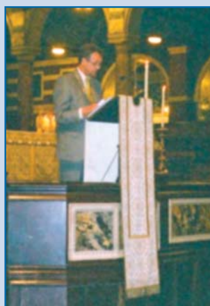
Grand President gives the first reading

There is now no doubt that this Festival is becoming a major event in the English Catholic Calendar and Cardinal Cormac Murphy O'Connor said during his regular informal visit, "What a wonderful and expressive day for English Catholics".